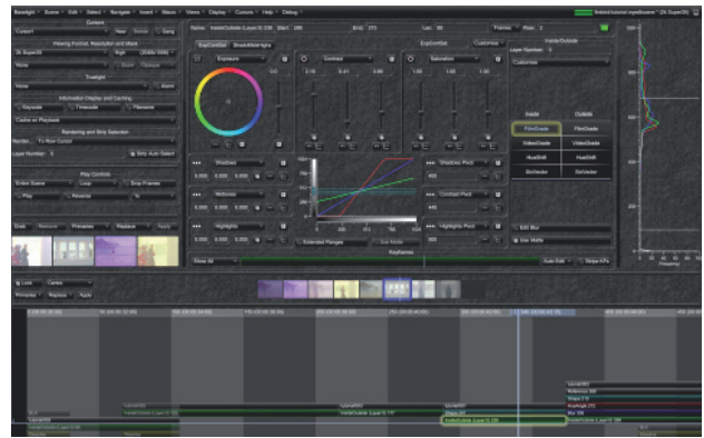
The Baselight User Interface