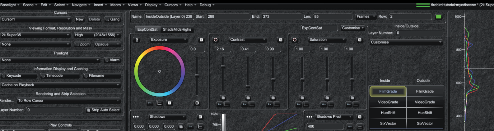
Smooth, effortless grading with Baselight